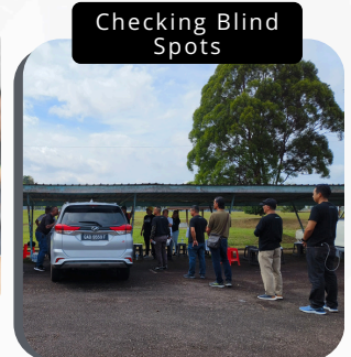
Checking Blind Spots