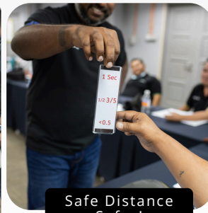
Safe Distance Safes!