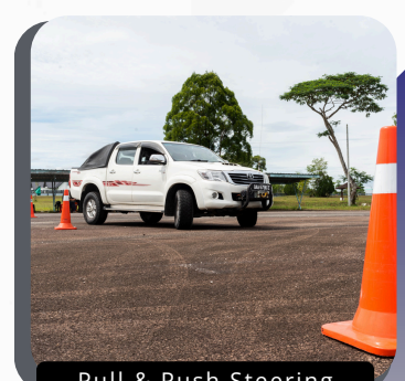
Pull & Push Steering