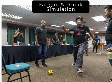
Fatigue & Drunk Simulation