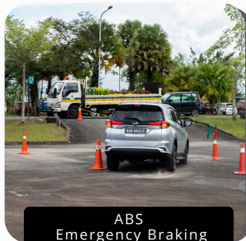
ABS Emergency Braking