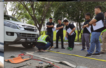
Tools & Equipment Display