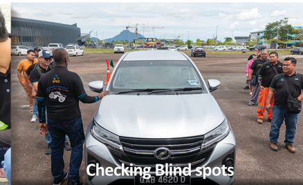
Checking Blind spots