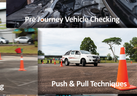
Push & Pull Techniques