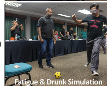
Fatigue & Drunk Simulation