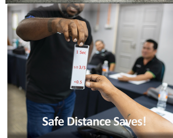
Safe Distance Saves!