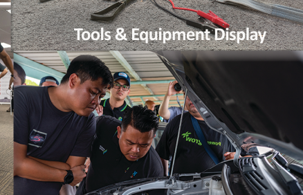
Pre Journey Vehicle Checking