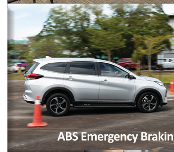
ABS Emergency Braking